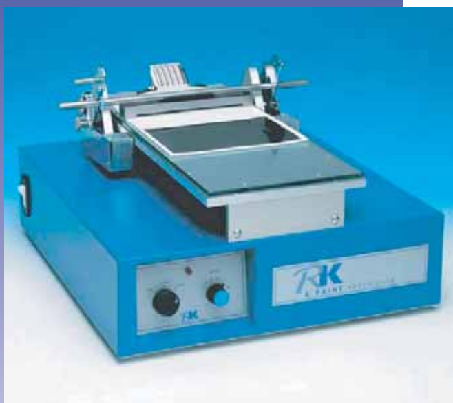
The K Paint Applicator

Used for the application of paints to produce highly accurate and repeatable coatings in an instant. The machine uses gap applicators to coat onto paint test charts, steel panels and many other substrates. This may then be used for many applications including quality control – weather testing, opacity and other standard tests such as colour matching and customer presentation samples.