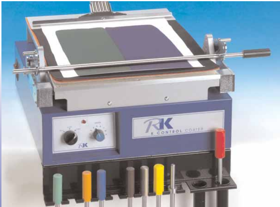
Above: K control Coater model 202. Below: K Control Coater model 101.